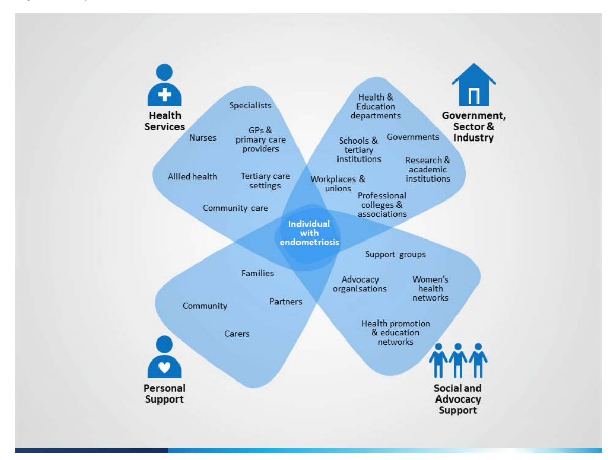
Figure 6: Key partners for successful implementation

By using this National Action Plan, all partners will be able to better focus their attention on key areas where they are best placed to provide additional support and ensure their investment is appropriately directed. These partnerships are represented in Figure 6.