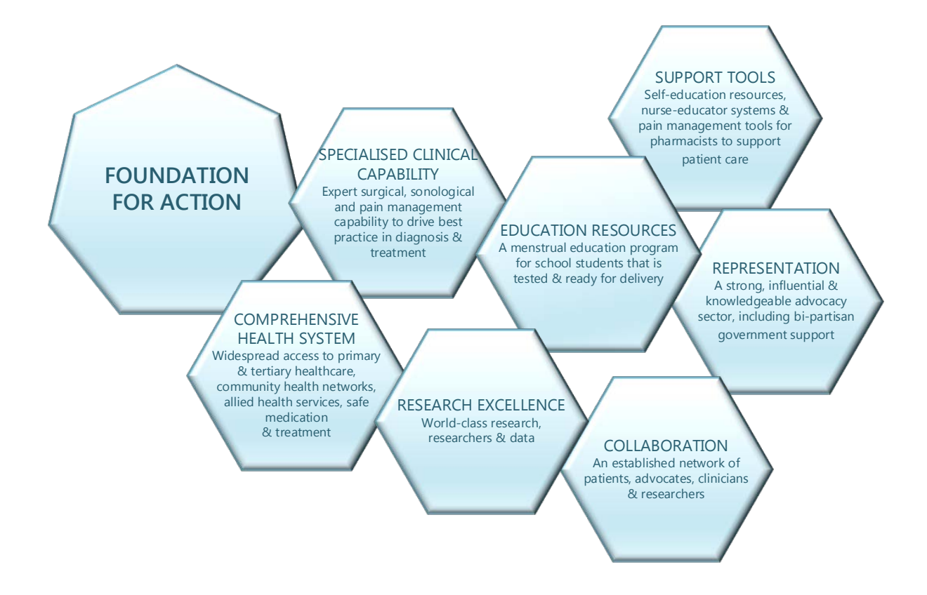
Figure 3: Enablers to support action in the Australian health system

This enabling environment is illustrated in Figure 3.